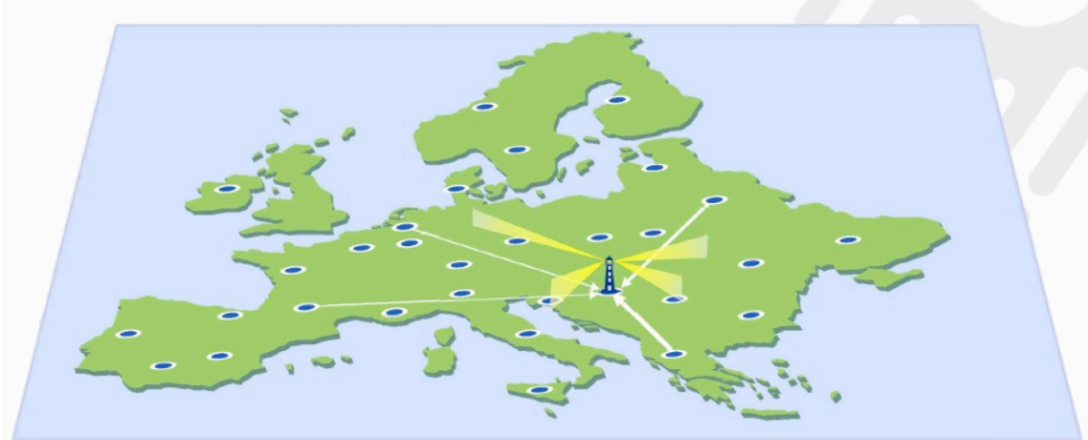
SCoDIHNet DIH are the referenced DIH for Smart Connectivity